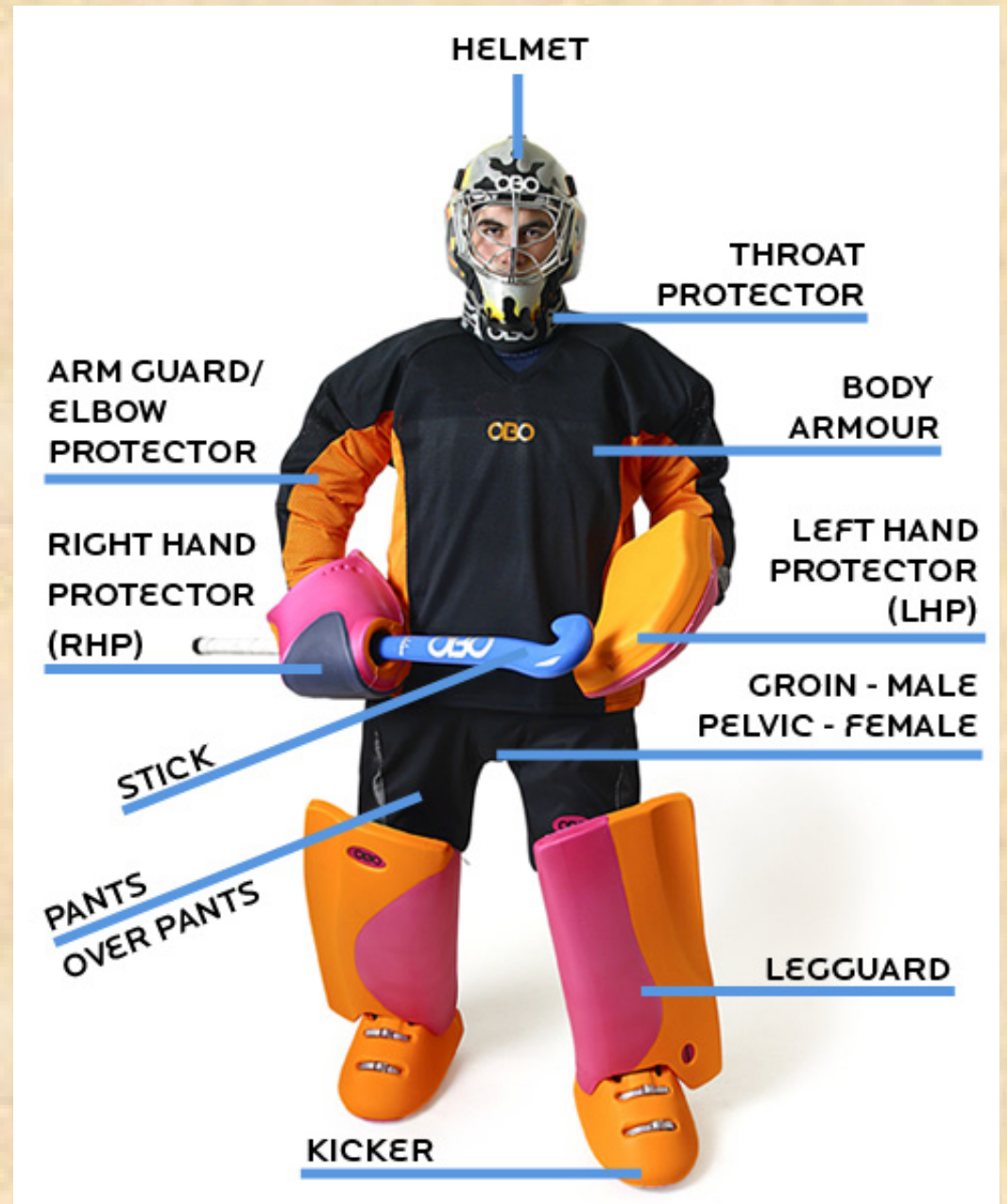
The official Hockey Grass equipment